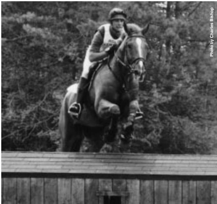
The performance horse depends upon the energy provided by his food.

Added dietary fat in the form of oil or an animal fat supplement is another source of energy for the horse. The advantage of feeding dietary fat is the concentrated nature of the energy source. Fat can be fed in smaller amounts than grain for the same amount of energy. Further, it appears that horses that have added dietary fat adapt to utilizing fat as an energy source more rapidly than horses with no fat in the diet. The amount of energy available from fat stores is much greater than the stores of glycogen. Therefore, any energy substrate that is stored in such great quantities is